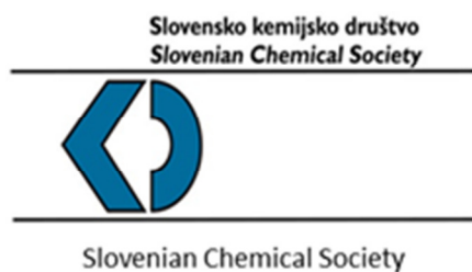
Slovensko kemijsko društvo Slovenian Chemical Society